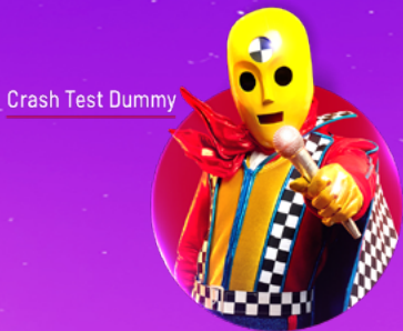
Crash Test Dummy